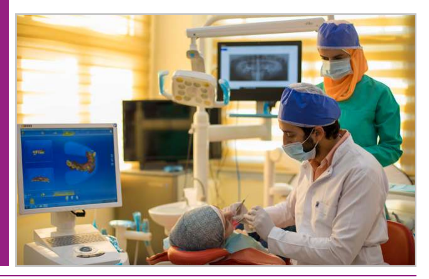
Learn How To Think Not What To Think

Not only will you develop clinical skills across the full range of dental disciplines, but you will also build the foundation of scientific knowledge on which clinical practice is based. In addition, you will appreciate the ethical and legal basis for dental practice, and acquire appropriate skills for communicating with your patients and helping them deal with what many find an anxious experience. The dentist also works as part of the dental team and you will learn about the roles and responsibilities of all members of this team and work with them in the care of your patients.